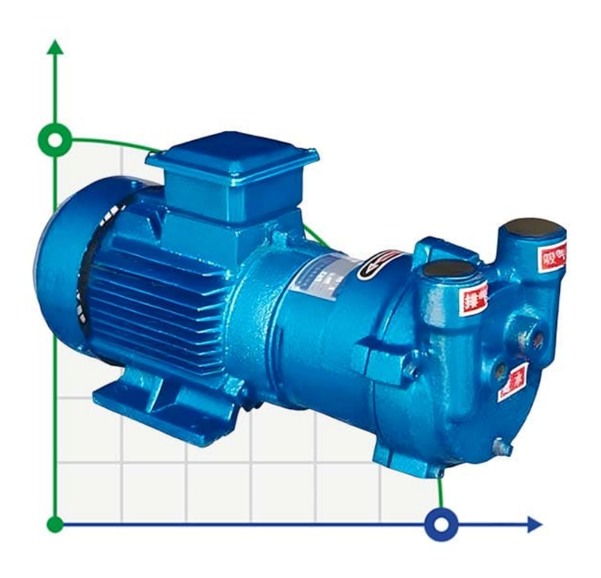
Catalog 2BV series water ring vacuum pumps

https://prom-nasos.pro https://bts.net.ua https://prom-nasos.com.ua +38 095 656-37-57, +38 067 360-71-01, +38 063 362-12-31, info@prom-nasos.pro